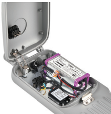
Top Opening Easy Maintenance